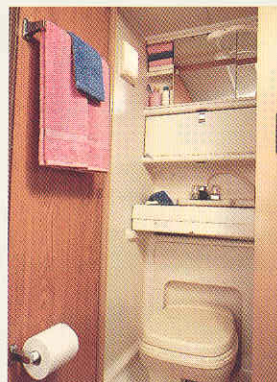
The space-saving bathroom walls expand for extra room.