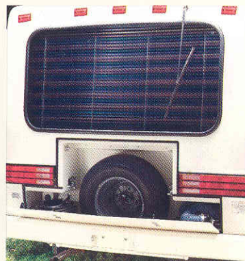
The fiberglass rear cap has an extra-large window and integrated storage for the spare and electrical cord.