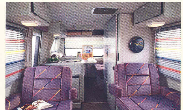
The LeSharo 220LX features Euro-styled cabinets, wall trim, upholstery and mini-blinds (blind colors may vary).