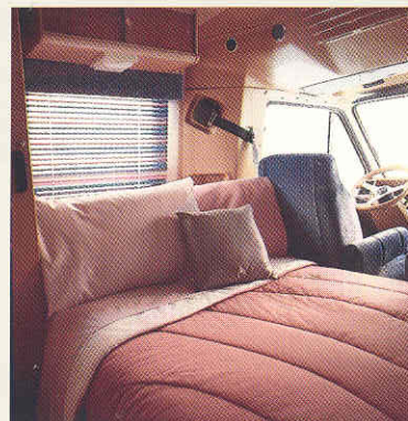
The companion seats convert easily into a comfortable bed.