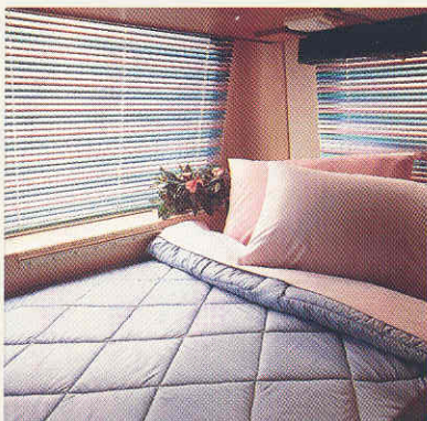
The dinette seats four and becomes a wide, comfortable bed.