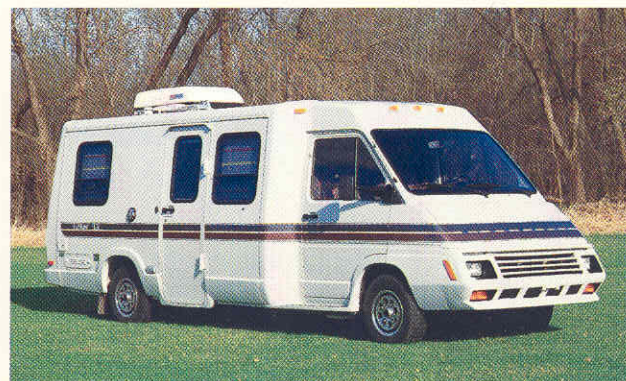
The handsome LeSharo 220LX has a higher level of standard equipment.