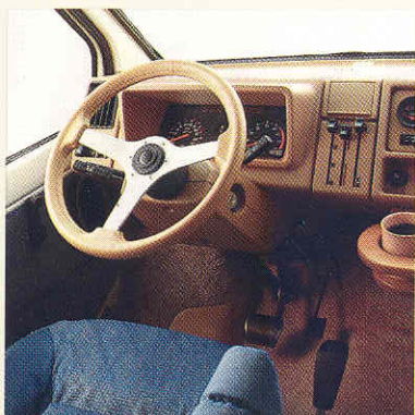
The well-designed dash includes easy to read gauges and an AM/FM/cassette stereo.

When you own a Winnebago, you can belong to the Winnebago-Itasca Travelers Club. The club offers motor homers programs and special events that help make life on the road easier and more fun. Call 1-515-582-6874 for more information.