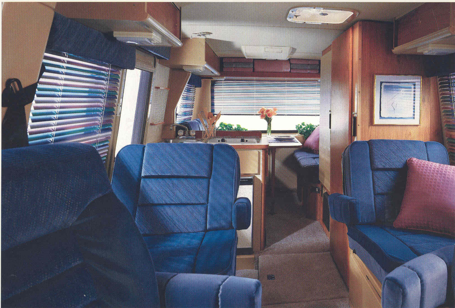
Its efficient design gives the LeSharo 220RD plenty of living space and features, making it a comfortable home on the road.

Buy a LeSharo. It's three of the best vehicles you'll ever own. And best of all, it's a Winnebago®.