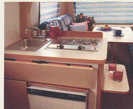
For meals and snacks, the galley has a sink, 2-burner range top and refrigerator.