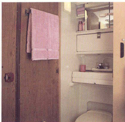
Phasar's unique, expanding bathroom borrows space-saving ideas from Pullman cars.