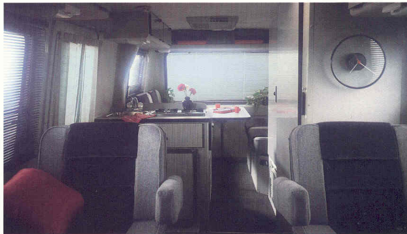
The interior of the 220i creates a stylish environment with fine upholstery and specially designed cabinetry and counters.