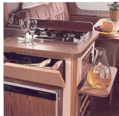
In the galley and elsewhere, our designers took full advantage of every nook and cranny.