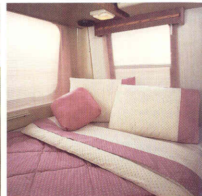
The functional dinette converts into a full sized bed.