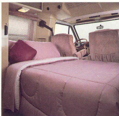
For added flexibility, our lounge chairs convert into a surprisingly roomy bed.