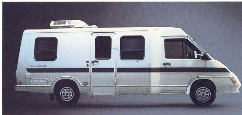
The 220i offers a special flair and plenty of additional standard features.